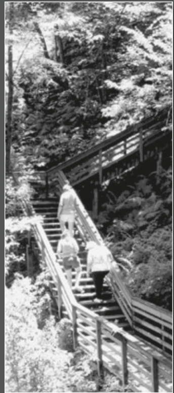
Visitors walk down 232 wooden steps to the floor of this large sinkhole known as the Devil's Millhopper. Field with lush flora and plant species, the sinkhole echoes the persistent trickle of dozens of tiny waterfalls. A visitor's center exhibits fossilized teeth, bones and marine shells from eras long ago. A nature trail, perfect for biking, winds its way around the sinkhole.