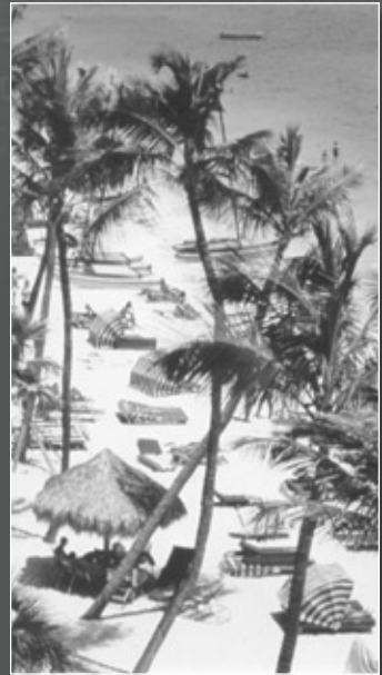
Some of Florida's most popular beaches along the Gulf of Mexico or the Atlantic Ocean are all within a short drive from Gainesville.

The average daily temperature in Gainesville is 70 degrees!