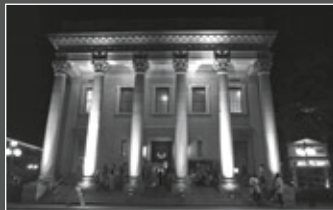
The Hippodrome state theater is the heart of downtown Gainesville, which has unique restaurants, coffee shops and entertainment.

The Butterfly Rainforest is a new and permanent exhibit at the Florida Museum of Natural History located on campus. The screened vivarium houses subtropical and tropical plants and trees to support 55 to 65 different species and hundreds of free-flying butterflies. Guests can stroll through the Butterfly Rainforest on a winding path and relax to the sounds of cascading waterfalls year-round.