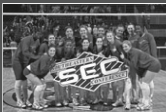
The Gators won their 17th straight SEC title, tying the NCAA women's volleyball record for the most consecutive conference championships.