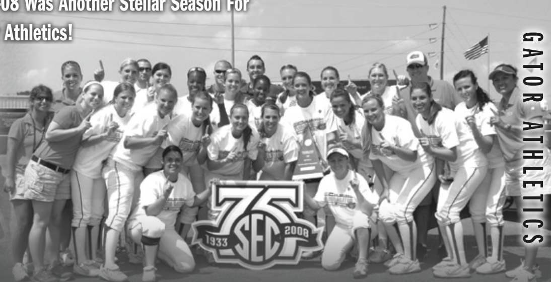
The 2007-08 Gator softball team advanced to its first-ever Women's College World Series, after capturing the SEC regular-season and Tournament championships.