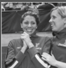
Caroline Burckle was the 2008 recipient of the Swimming & Diving Honda Sports Award as the top collegiate swimmer of the year. She claimed the 200- and 500- yard freestyle titles at the 2008 NCAA Championships. Burckle later secured a spot on the 2008 U.S. Olympic Team, earning a bronze medal in the 800-meter free relay.