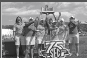
The Florida women's golf team won its eighth overall SEC Championship and first-ever NCAA regional title, en route to a ninth-place showing at the NCAA Championship during the 2007-08 season.