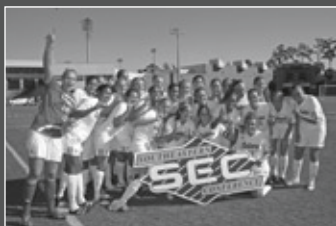
Florida soccer collected its eighth SEC title, also winning its eighth SEC Tournament championships and advancing to the NCAA Round of 16.