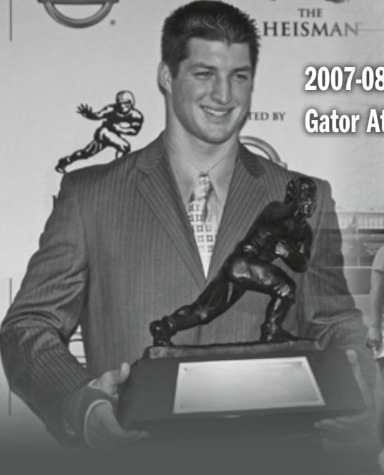
Florida Gators Quarterback Tim Tebow made history in 2007 by becoming the first sophomore ever to win the Heisman Trophy, college football's most coveted award.