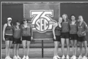
The 2008 Gator women's tennis team captured the 23rd SEC Regular-Season Championship in the 29-year history of the event, the most team titles won by any other league school in any women's sport. Florida went on to reach the NCAA Final Four for the 19th time in the last 22 years.