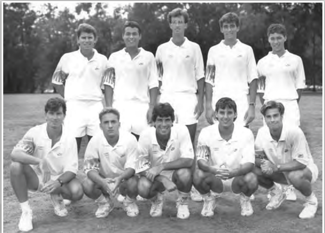
The 1990-91 Florida Gators were the first team in school history to advance to the NCAA Tournament.