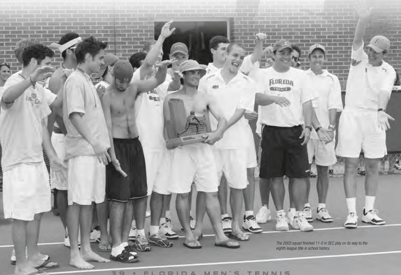
The 2003 squad finished 11-0 in SEC play on its way to the eighth league title in school history.