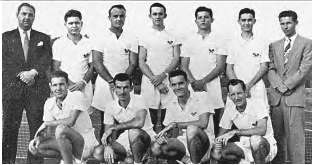
The 1950 squad won Florida's first-ever men's SEC title.