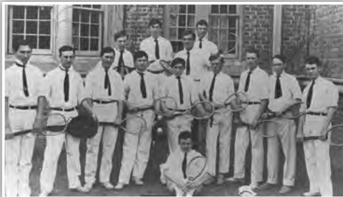
Although team records do not exist prior to the 1940 season, this photo of the 1910 Florida Gators is believed to be the school's first team.