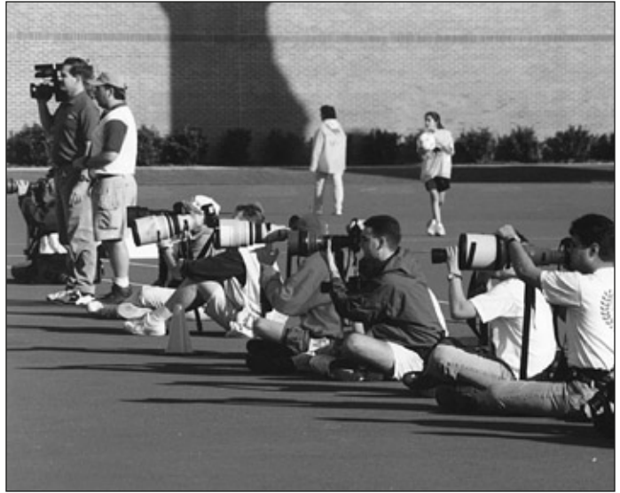
The University of Florida athletics program attracts national and statewide interest from newspapers, magazines, television and radio stations. Above, cameras line the end of the field at a Gator soccer match.

Sun Sports Network will air more than 100 UF events during the 2008-09 academic year, including three home soccer matches – Aug. 31 versus Nebraska, Sept. 26 versus Georgia and Oct. 23 versus Arkansas. The Sept. 7 match at Florida State will air live on FSN Florida. Florida also makes its debut as a Fox Soccer Channel's match of the week when it plays at South Carolina on Oct. 30. In addition, COX Sports Television will air one match yet to be scheduled. FOX Regional Sports Network, as part of the SEC-TV package, will air the Sunday, Oct. 5 match at Kentucky. SEC-TV also airs the championship match of the Nov. 9 SEC Tournament in Orange Beach, Ala., at 3:30 p.m. ET.