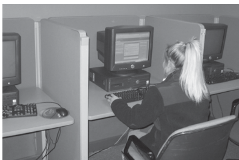
Farrior Hall has computer labs and study areas that are for exclusive use by Florida student-athletes.

The award winning OSL demonstrates UF's commitment to the total student athlete by providing comprehensive CHAMPS/Life programs which include academic counseling, tutoring, career and leadership development, community service and extensive services for students with learning disabilities. The OSL employs a staff of 15 fulltime employees to help student-athletes with all aspects of their academic careers. The OSL staff provides academic counseling that includes assistance in preparing class schedules, extensive tutorial services, career education workshops and job placement referrals.