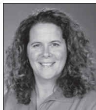
Mary Howard Communications