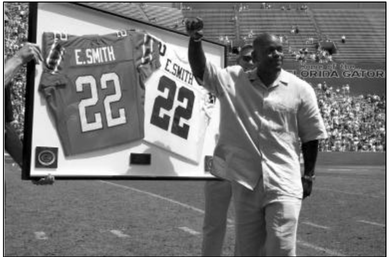
On April 12, 2003 Florida fans got the opportunity to recognize one of their own as Emmitt Smith was honored at halftime of the 2003 Orange and Blue Spring game.

Smith was a three-time All-American at the University of Florida from 1987-89. He established 58 school records in three seasons, including a career rushing mark of 3,928 yards. Following his junior season with the Gators, Smith was a first-round selection in the 1990 NFL Draft by the Dallas Cowboys. Smith finished the 2002 season with 17,162 career yards on 4,052 attempts, eclipsing Walter Payton's 18 year-old NFL rushing mark against Seattle on Oct. 27. On Wednesday, March 26, Smith agreed to terms with the Arizona Cardinals.