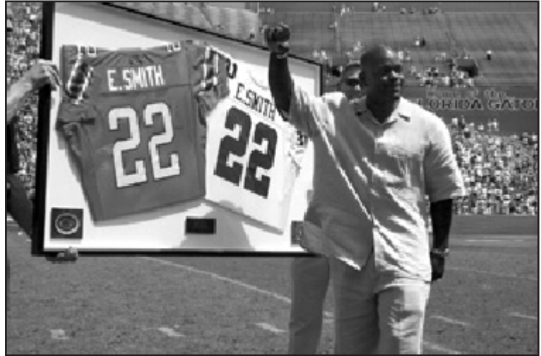
On April 12, 2003, Emmitt Smith was honored at halftime of the 2003 Orange and Blue Spring game.

Former Gator star Emmitt Smith became the NFL's all-time leading rusher on Sunday, Oct. 27, 2002, with an 11-yard run against the Seattle Seahawks in Dallas. Smith surpassed the long-time record held by Walter Payton, who rushed for 16,726 yards.