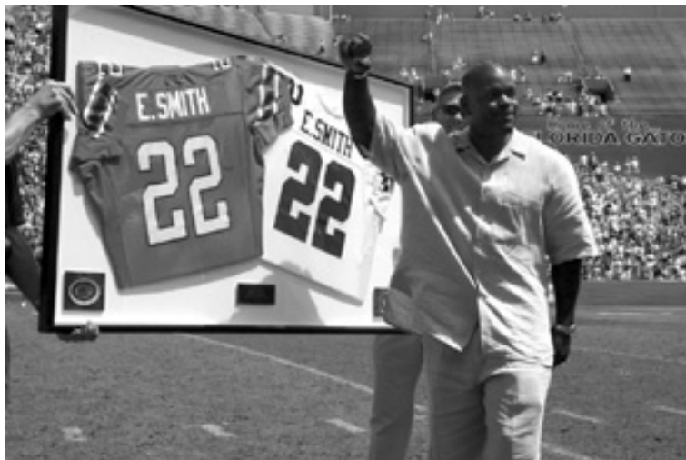
On April 12, 2003, Florida fans got the opportunity to recognize one of their own as Emmitt Smith was honored at halftime of the 2003 Orange and Blue Spring game.

Smith was a three-time All-American at the University of Florida from 1987-89. He established 58 school records in three seasons, including a career rushing mark of 3,928 yards. Following his junior season with the Gators, Smith was a first-round selection in the 1990 NFL Draft by the Dallas Cowboys. On Friday, Feb. 4, 2005, Smith retired from the NFL. Smith starred for 13 seasons with the Dallas Cowboys and spent the last two years with the Arizona Cardinals. He finished his career with 18,355 rushing yards and 164 rushing touchdowns, both of which are the highest totals ever posted in NFL history.