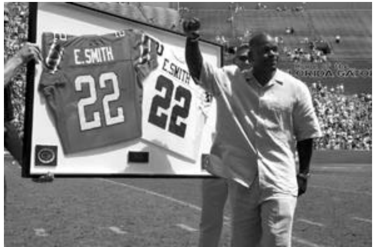
On April 12, 2003 Florida fans got the opportunity to recognize one of their own as Emmitt Smith was honored at halftime of the 2003 Orange and Blue Spring game.

Former Gator Emmitt Smith became the NFL's all-time leading rusher on Sunday, Oct. 27, 2002 with an 11-yard run against the Seattle Seahawks in Dallas. Smith surpassed the long-time record held by Walter Payton, who rushed for 16,726 yards in his 13-year.