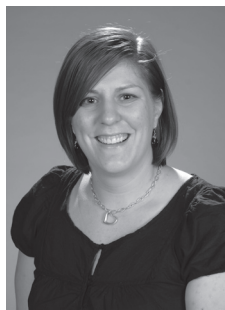
Zanna Ollove Communications