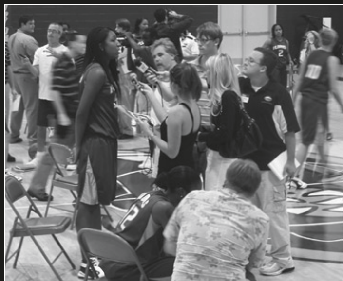
The Gator athletics program enjoys tremendous state-wide coverage.