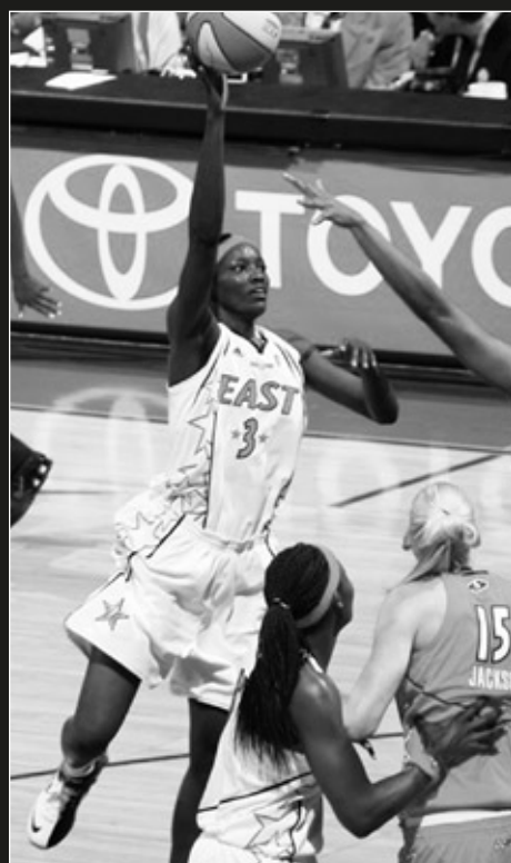
Delisha Milton-Jones scored 11 points with five rebounds helping the East defeat the West in the 2007 WNBA All-Star Game.