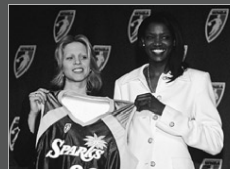
DeLisha Milton was the fourth overall selection in the 1999 WNBA Draft.