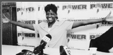
DeLisha Milton spreads her 84-inch wing span after the ABL's Portland Power made her the second overall draft pick in 1997. Two years later, she became the fourth overall selection in the 1999 WNBA draft.