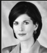
Sharyl T. Attkisson