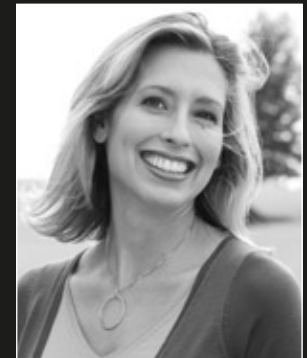
THE WEATHER CHANNEL

No other law school has produced as many presidents of the American Bar Association in the past four decades than the University of Florida.