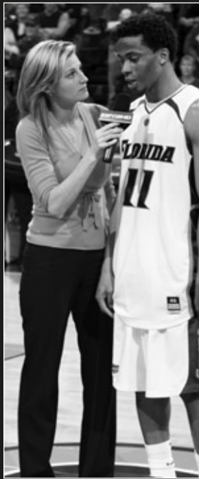
Erin Andrews , who earned her telecommunications degree from UF in 2000, has become a familiar face on ESPN broadcasts as a reporter since joining the network in 2004. Andrews, who provides coverage of everything from college football and basketball to Major League Baseball, was a member of the Dazzlers - a dance team of UF students that performs on the sidelines of Gator athletic events.