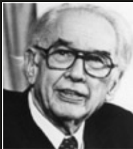
John V. Atanasoff