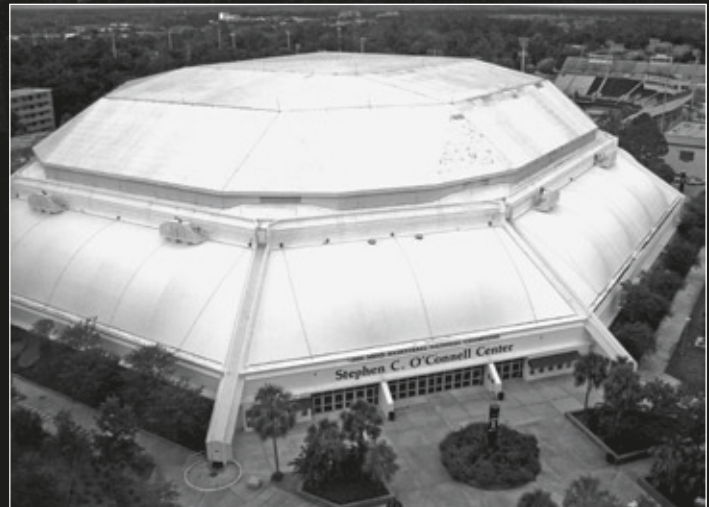
The Stephen C. O'Connell Center has been the site of all women's games since its opening in 1981.

The Stephen C. O'Connell Center is also the site of University of Florida graduation ceremonies, as well as many other university functions, including Career Day. The facility has also accommodated numerous NCAA championship events, concerts, step shows, comedians, guest speakers, Disney shows, conventions and banquets.