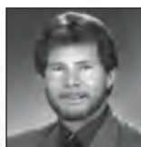
BO LAURAMORE STADIUM MAINTENANCE