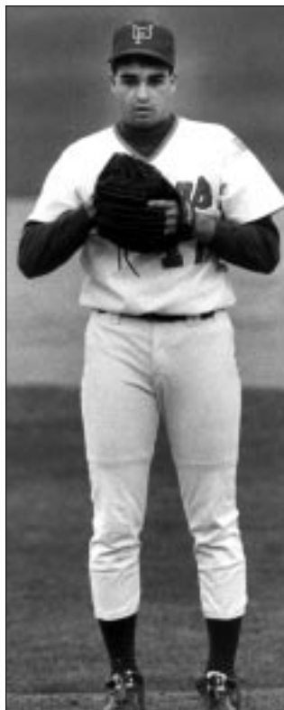
A three-time All-SEC selection between 1991-93, Marc Valdes still occupies the top spot in six of UF's career pitching categories: innings pitched (394.2), walks issued (167), hit batters (65), games started (55), wild pitches (36) and wins (31).